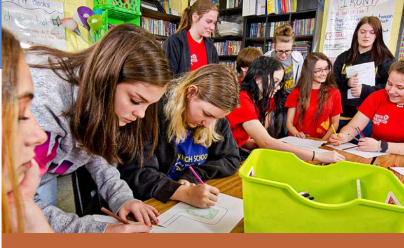
YVC Clubs provide high school students with leadership and volunteer opportunities.

The Social Environment Initiative addresses social capital by supporting leadership and nonprofit development and increased community and civic engagement.