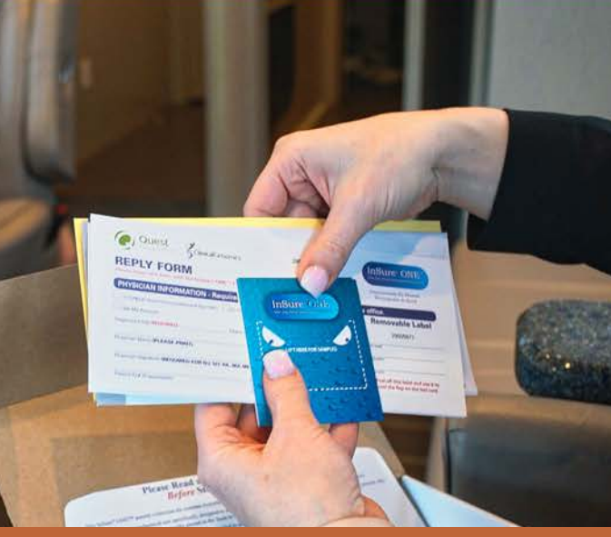
The Healthcare Access Initiative funds cancer screenings and a medication program, and it works to increase the capacity of community health centers to reduce the health disparities in Cenla.