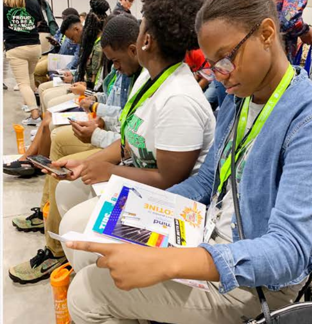
Healthy Behaviors Initiative grants fund the annual Youth Summit on Healthy Behaviors, where students receive awareness and advocacy training in the areas of tobacco prevention, substance and alcohol abuse prevention, healthy eating and active living.

Research shows smoking cessation services are an important part of a comprehensive tobacco prevention and control program. The Foundation supports cessation counseling through a grant to CMAP to provide administration and oversight to CMAP's partnership with the Smoking Cessation Trust. This program offers direct cessation services to Louisiana residents who started smoking before September 1, 1988. Members receive medication and counseling to help their cessation efforts.