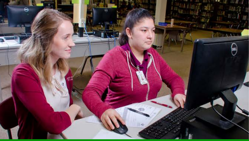
The Education priority area funds career and postsecondary counseling for Central Louisiana high school students (left), and the annual Students Exploring Career Opportunities expo (right).